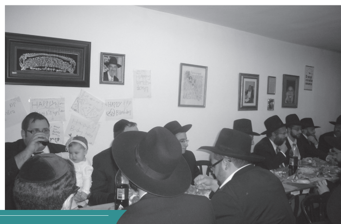
Inaugural Melave Malka in ארץ ישראל